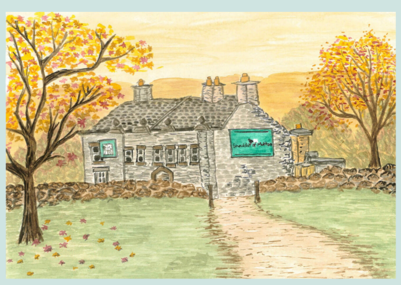
Ask a member of the team about our FREE function room hire and buffet options!

Facebook: shoulder of mutton Twitter: @shoulderofmutt